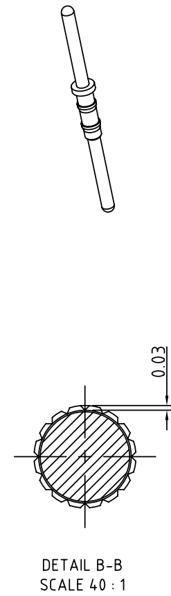
DETAIL B-B SCALE 40 : 1

Technical Data: Material: ● Pin (outer sleeve) : Brass,machined, CuZn38Pb2(Need melting due to bending) ● Plating(outer sleeve) : Cu 40 u"-80 u"+Ni 50 u"-80 u"+Sn 200 u"-240 u" ● Dimmension of exterior diameter added 0.0145-0.020mm after plating.